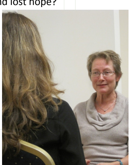
Integrate Needs-Based Coaching

Learn to speak in a way that encourages people to listen, and listen in a way that encourages them to speak.